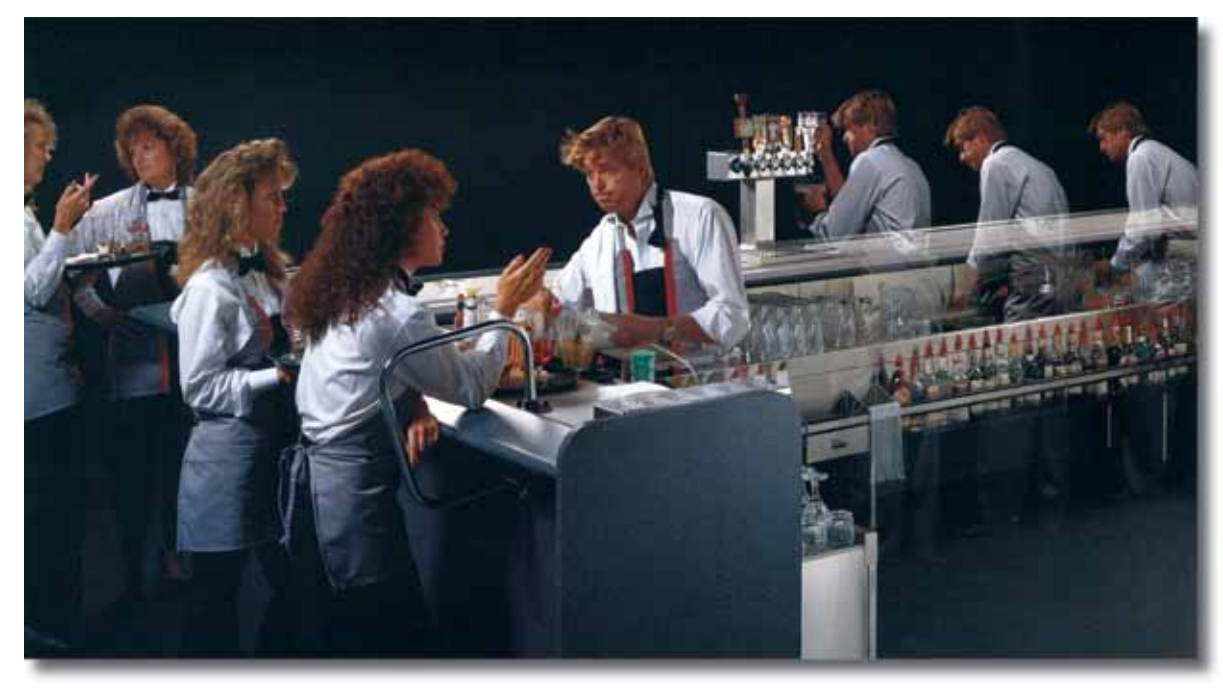
Ever have a customer wait for a drink? Why not double your bartender's output!